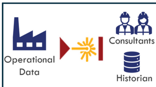
Cyber Secure Data Broker

The T-Streamer Data Broker, in conjunction with the FEND Data Diode, offers a simple and 100% secure solution to protect your operational infrastructure.