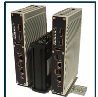
DIN Rail Mounted Cyber Secure Solution

The solution is also available in a compact server rack mount.